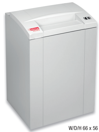
W/D/H 66 x 56 x 105 cm